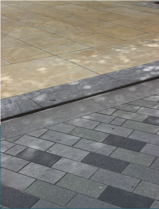
Provide sandstone footways & granite surfaces on heavily used routes, that also helps to define cycling & servicing areas