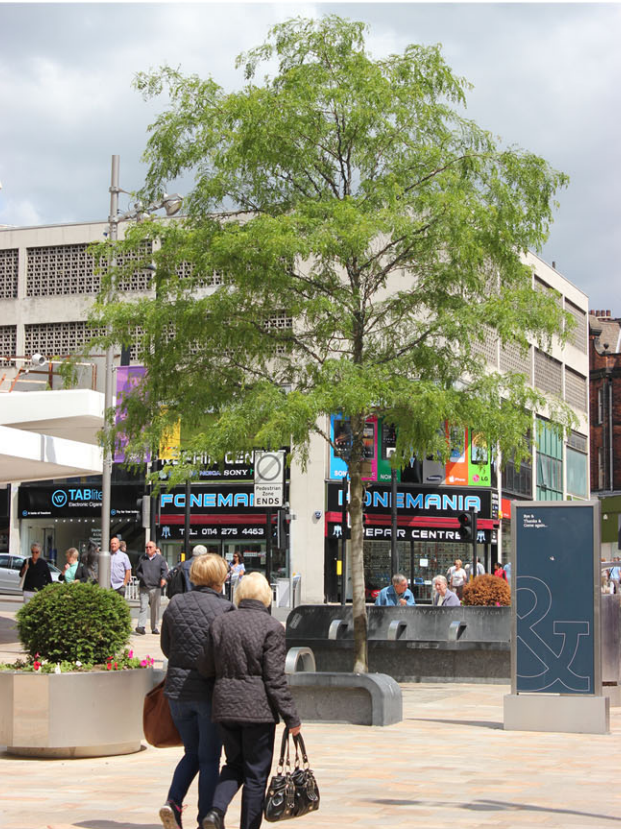
Provide increased numbers of trees to help with city cooling & explore tree species that can cope with the rising urban temperatures