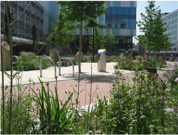
Integrate cycle infrastructure into overall concept for how the street can look