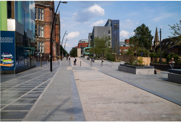
New combined cycleways & servicing routes at the University of Sheffield