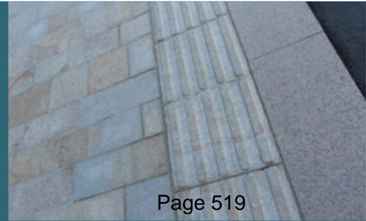
Provide directional tactile markers on key routes throughout the project area