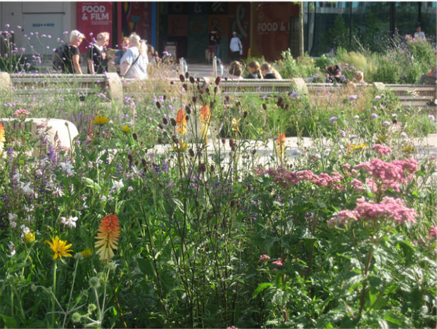
Use the planting to create spaces & places that feel more human in scale, which help create a more comfortable resting environment