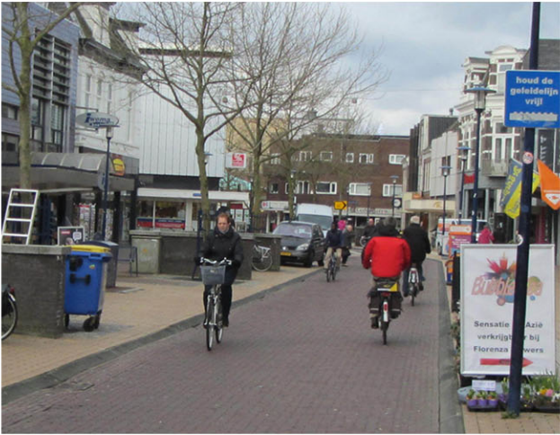
Provide cycling on key routes to improve connectivity & join up areas of cycle infrastructure throughout the City Centre